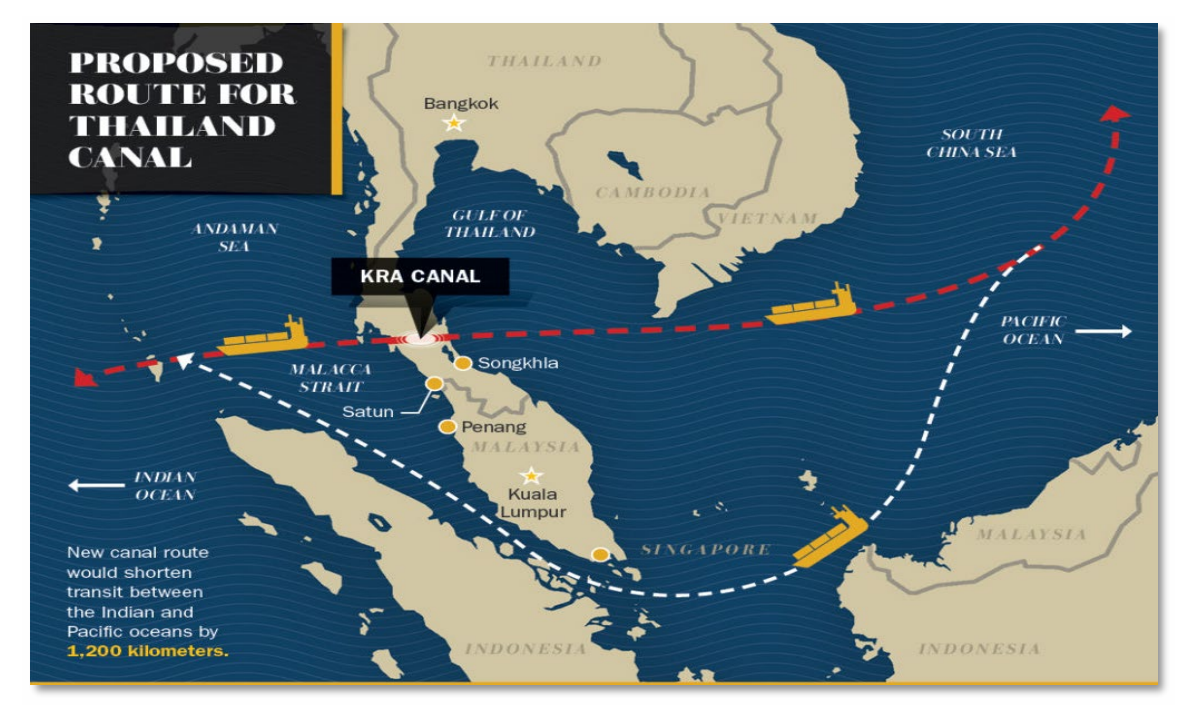
Figure 2: The KRA Canal Project

China has been actively pushing for construction of a man-made waterway, as part of its Belt and Road Initiative that cuts through Thailand to connect the South China Sea with the Andaman Sea— slashing transit times between them by two to three days. The proposed Kra Canal would stretch more than 100 km across the Kra Isthmus which is the narrowest point of the Malay peninsula. The new route could be an alternative to the route through the Straits of Malacca. This would also allow the Chinese navy to move ships quickly between its newly constructed bases in the South China Sea and the Indian Ocean.