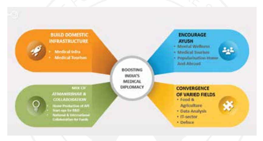
Fig 3: Author's depiction of India's Way Ahead to Boost its Medical Diplomacy

Domestic Infrastructure. Any country's primary responsibility lies in ensuring the well-being of its domestic population. This impacts not only the domestic situations but also India's economic and diplomatic prospects. India will certainly need to balance its domestic requirements with its outreach abroad. It must be acknowledged that it has largely attempted to be able to ensure the same – the most recent example being lifting of bans on the export of essential drugs during the COVID crisis only after ensuring the required surplus for domestic consumption. But, the shortfalls in public spending in the health sector require much more planning and even more on-ground implementation. According to a report published in 2019 by the Centre for Disease Dynamics, Economy and Policy, a US based think tank, India currently faces a shortage of 6,00,000 doctors and over 2 million nurses. 55 Affordable healthcare is still nowhere close to reality. Presenting the worst dichotomy,