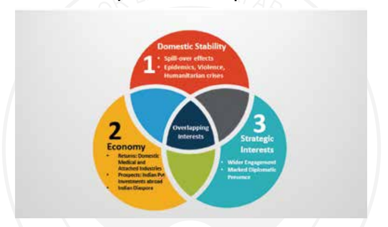
Fig 2: Author's Depiction of the overlapping gains and opportunity costs served by India's Medical Diplomatic Initiatives

Domestic Stability. As immediate repercussions, instability in the neighbourhood (as well as extended neighbourhoods) poses ripple-over effects to domestic stability. This regional/extra-regional instability could be categorised as an outgrowth of epidemics, natural disasters, or violence (civil wars/external wars/armed insurgencies). Each of this has a crucial aspect of 'health security' attached to them which merits diplomatic attention.