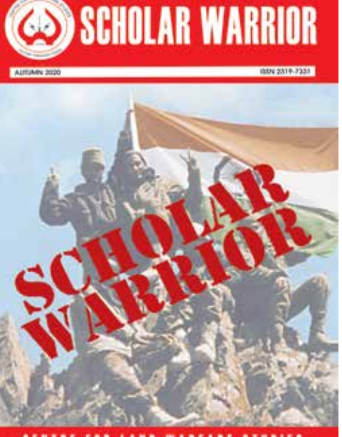
CENTRE FOR LAND WARFARE STUDIES