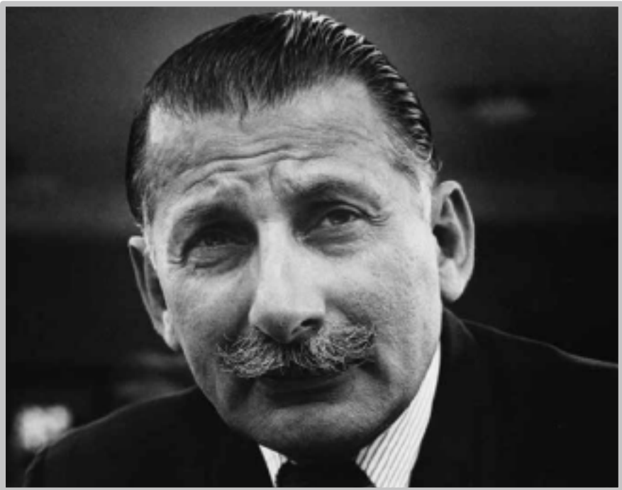
Field Marshal SHFJ Manekshaw, MC 1914-2008

Field Marshal Sam Hormusji Framji Jamshedji Manekshaw , better known as Sam “Bahadur”, was the 8th Chief of the Army Staff (COAS). It was under his command that the Indian forces achieved a spectacular victory in the Indo-Pakistan War of 1971. Starting from 1932, when he joined the first batch at the Indian Military Academy (IMA), his distinguished military career spanned over four decades and five wars, including World War II. He was the first of only two Field Marshals in the Indian Army. Sam Manekshaw’s contributions to the Indian Army are legendary. He was a soldier’s soldier and a General’s General. He was outspoken and stood by his convictions. He was immensely popular within the Services and among civilians of all ages. Boyish charm, wit and humour were other notable qualities of independent India’s best known soldier. Apart from hardcore military affairs, the Field Marshal took immense interest in strategic studies and national security issues. Owing to this unique blend of qualities, a grateful nation honoured him with the Padma Bhushan and Padma Vibhushan in 1968 and 1972 respectively.