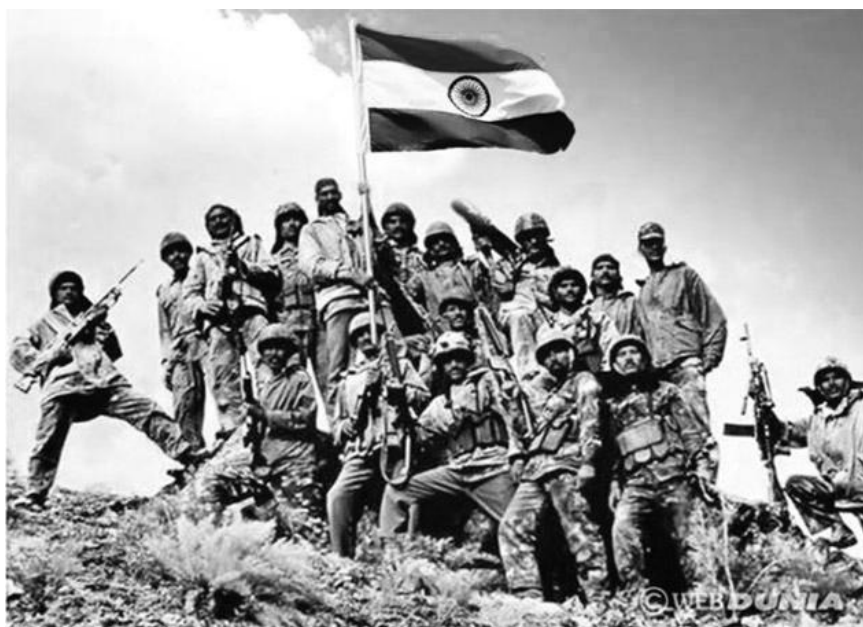
The Euphoric Indian Soldiers atop a post during Kargil Conflict.