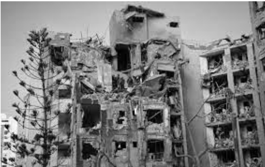
A picture of a building in Beer Sheba after being hit by Ballistic Missile from Iran.

The strikes at Beer Sheba, the Haifa Port, Mossad Headquarters, and other important military and civilian establishments of Israel reflected resilience as a Nation and also the intelligence and technological prowess of Iran. As the efficacy of the Israeli air defence reduced, the Iranians were able to hit back with greater accuracy and frequency. It would be safe to assume that the peacetime diligence in gathering technical intelligence had enabled the Iranians to push back the Israelis who were supported by the USA and other western countries. The development of modern systems including weapons, that were employed to strike back at Israel, in an environment of severe sanctions for decades also reflected the intellectual and scientific prowess of Iran.