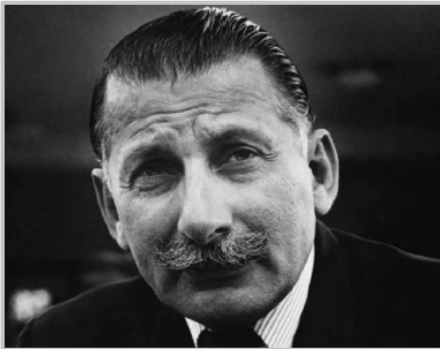
Field Marshal SHFJ Manekshaw, MC 1914-2008

Field Marshal Sam Hormusji Framji Jamshedji Manekshaw , better known as Sam “Bahadur”, was the 8th Chief of the Army Staff (COAS). It was under his command that the Indian forces achieved a spectacular victory in the Indo-Pakistan War of 1971. Starting from 1932, when he joined the first batch at the Indian Military Academy (IMA), his distinguished military career spanned over four decades and five wars, including World War II. He was the first of only two Field Marshals in the Indian Army. Sam Manekshaw’s contributions to the Indian Army are legendary. He was a soldier’s soldier and a General’s General. He was outspoken and stood by his convictions. He was immensely popular within the Services and among civilians of all ages. Boyish charm, wit and humour were other notable qualities of independent India’s best known soldier. Apart from hardcore military affairs, the Field Marshal took immense interest in strategic studies and national security issues. Owing to this unique blend of qualities, a grateful nation honoured him with the Padma Bhushan and Padma Vibhushan in 1968 and 1972 respectively.