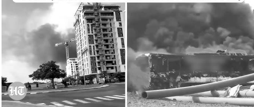
Mossad location hit by Iran on 17 June 2025.